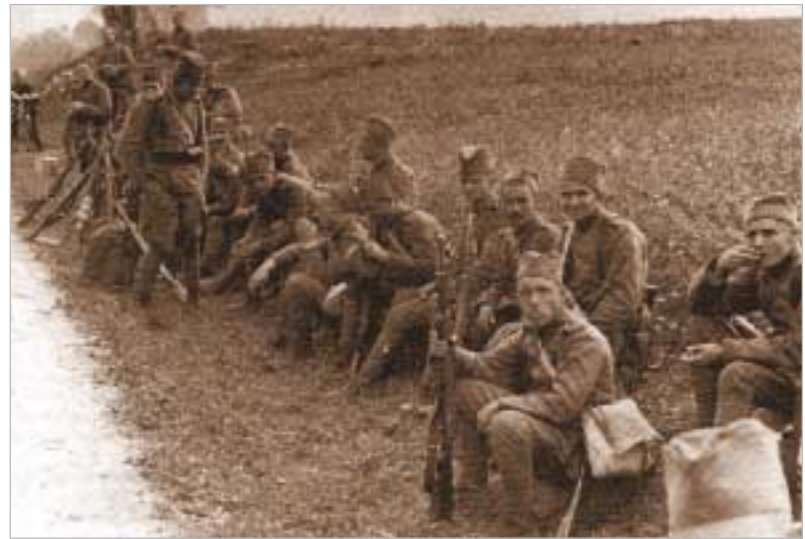
Slovenian soldiers during manoeuvres, wearing the uniforms of the Royal Yugoslav Army.

Faced with resistance, the German, Italian and Hungarian occupying forces resorted to extreme terror. Partisans caught were not treated as prisoners of war, hostages were taken and shot; civilians were deported to concentration camps in large numbers. Aided by the Roman-Catholic Church in Slovenia, in summer 1942 Italians organised local quisling units known as MVAC (anti-Communist militia). Following the capitulation of Italy, in autumn 1943 the German occupying forces formed anti-Resistance units called "Slovenian homeguards (militiamen)". These quislings swore to fight under the command of Hitler against partisans and their allies