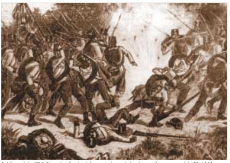
Soldiers of the 47th Slovenian-Styrian infantry regiment in battle near Costuzza on July 25, 1848.

From 1820 to 1866 Slovenian regiments made part of the Austrian occupation army in Italy. They also took part in wars fought against Italy (1848–49, 1859 and 1866), Denmark (1864) and even Prussia (1866); they were also sent to Bosnia and Herzegovina, which was occupied in 1878. In addition, Slovenian soldiers fought bravely in battles near Italian