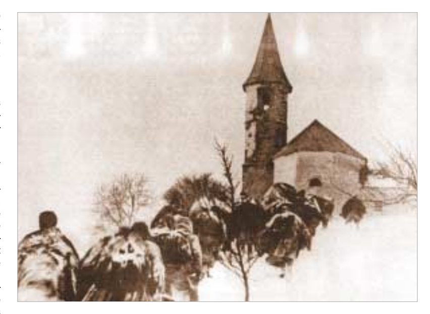
The elite, well-armed 14<sup>rd</sup> Division of the National Liberation Army – which included partisan detachments – undertook the first major manoeuvring march of the Slovenian Army during World war II.

signed at Brioni on July 7, 1991 – on the initiative of European negotiators – whereby the Slovenian independence act was postponed for three months, but in the meantime the national defence forces remained in control of the whole Slovenian territory. The Yugoslav units were blocked in barracks and, under the circumstances, the Yugoslav presidency decided to have the army move out of Slovenia. The last Yugoslav soldier left Slovenia during the night from the 25<sup>th</sup> to the 26<sup>th</sup> October of 1991.