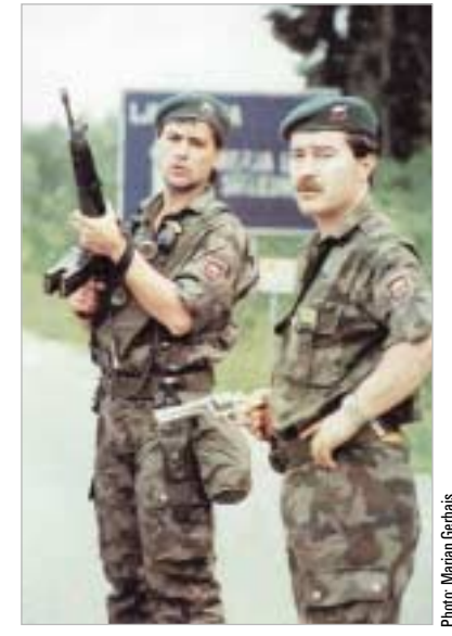
Member of special forces of Territorial Defence of Slovenia during the liberation fight in 1991.

Thus 1991 marks the beginning of Territorial Defence of the Republic of Slove-