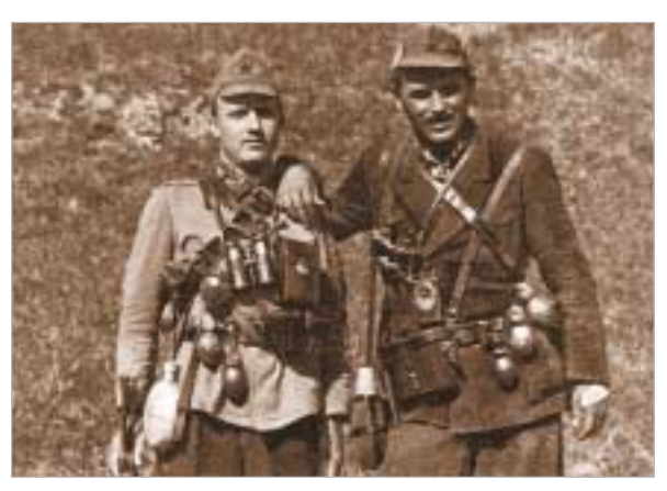
Slovenian partisans during World war II.

gin with, they deported intelligentsia, teachers and priests.